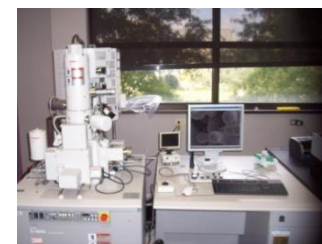
FE-SEM Hitachi S-4800